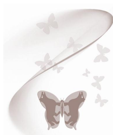
Logo for the Lupus – As I see it - competition

To draw attention to SLE and the challenges of living with this disease, the Hungarian Gabriella Schopper Lupus Group would like to announce an international photo competition for all to take part.