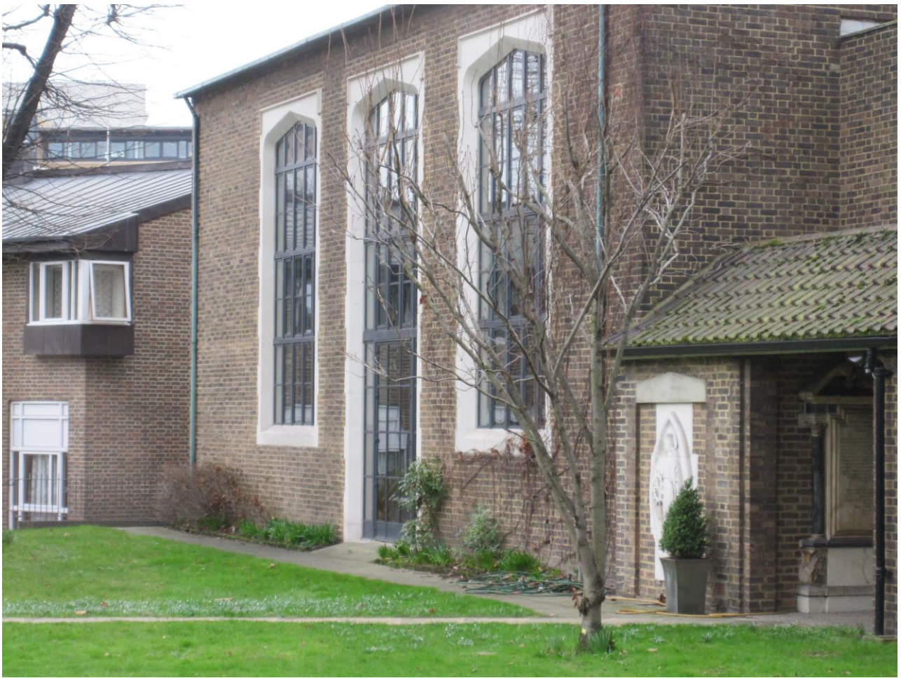
St. Katharine's in London, chapel